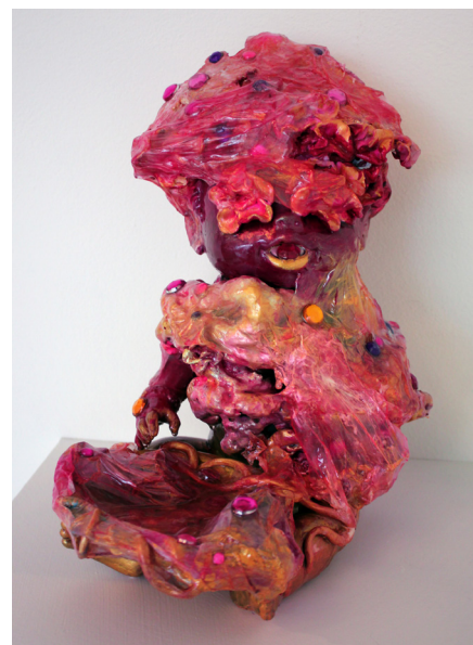
Pretty Is As Pretty Does , 2018 Mixed media, 9.5"x6.5", $300

Also on Exhibition: Who's That Cutie Pie , 2018 All Out in the Wash , 2018