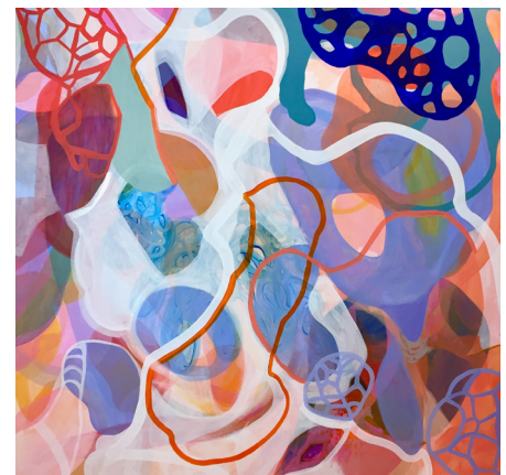
Color Chord Womb no. 2 , 2017 Acrylic on canvas, 60"x60", $4600

Represented by: Gregg Irby Gallery in Atlanta, GA and Weinberger Fine Art in Kansas City, MO.