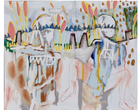
Distance Between the Sinks , 2018 Mixed media on canvas, 70"x58", $3,200