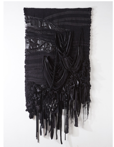
Here Today , 2019 Various fibers, 50"x84", $5200